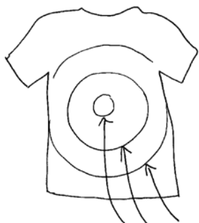
Where to place rubber bands