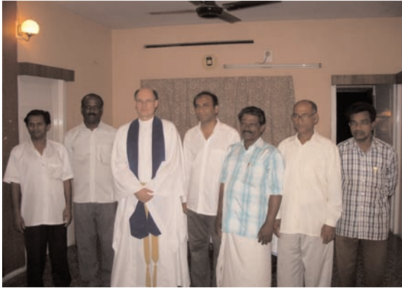
After a Church Service at the New Church in India Conference.