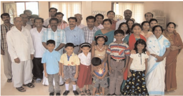
A larger group at the Conference. There were eight baptisms and Rev. Appelgren administered the Holy Supper